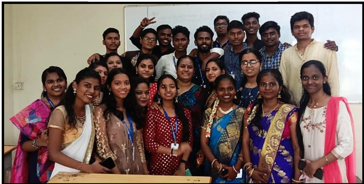
Figure 4 Traditional Day celebration by students of BAF